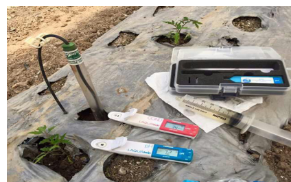
Figure 5: pH and conductivity testing on soil solution.