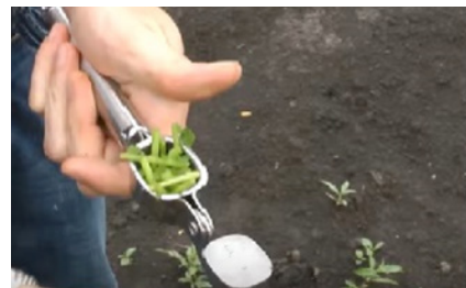
Figure 3: Loading of petioles into the chamber of garlic press for sap extraction.