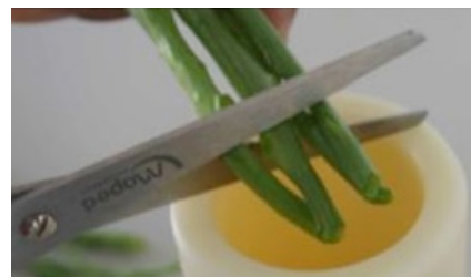
Figure 2: Cutting of petioles into small pieces.