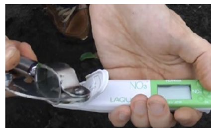
Figure 4: Placing sap directly onto LAQUAtwin nitrate sensor.