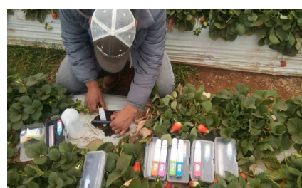
Figure 6: Irrigation water testing with LAQUAtwin pocket meters.